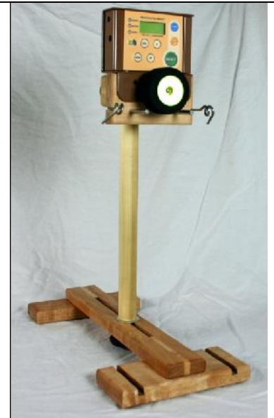
Electronic Yarn Meter