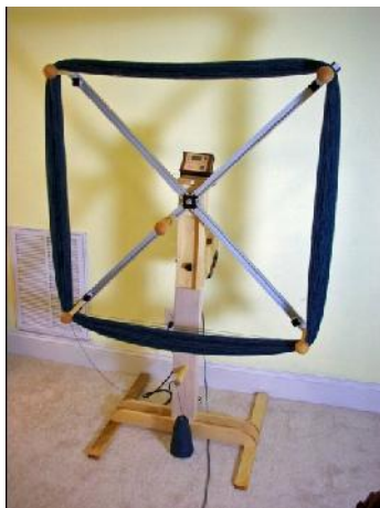
4 Yard Option