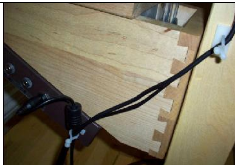
Cable Routing for ERC Data & Power