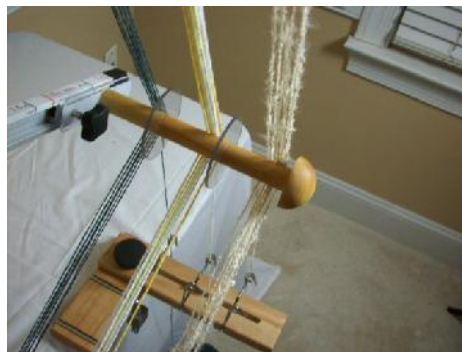
Triple Yarn Guide System