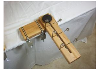
Retractable Table mount guide for Triple Yarn Guide System