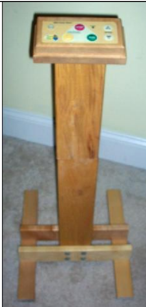
Control Panel Stand (30" high)