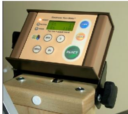
Electronic Rotation Counter