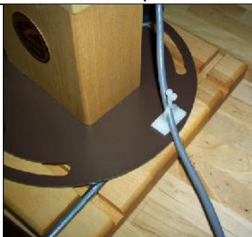
Cable Routing for Control Panel